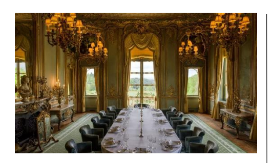
FOR 5* LUXURY WITH AWARD WINNING DINING CLIVEDEN HOUSE

Easy to reach, Windsor is located just 30 miles west of London with Heathrow Airport even closer, just 15 minutes away. The Royal Borough is set along 20 miles of the River Thames, we can offer five-star luxury retreats, riverside views, country house hotels and more.